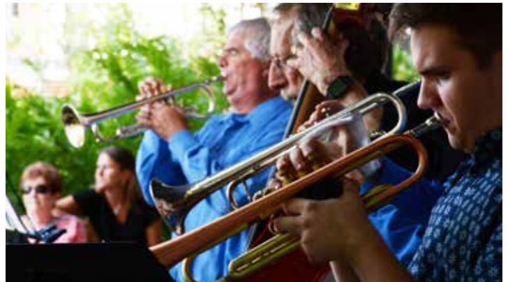
Guests of San Damiano's Wine and Jazz Reception in July were once again treated to wonderful weather, delectable appetizers and wines, and the CoolTones' uplifting renditions of stage and screen favorites.